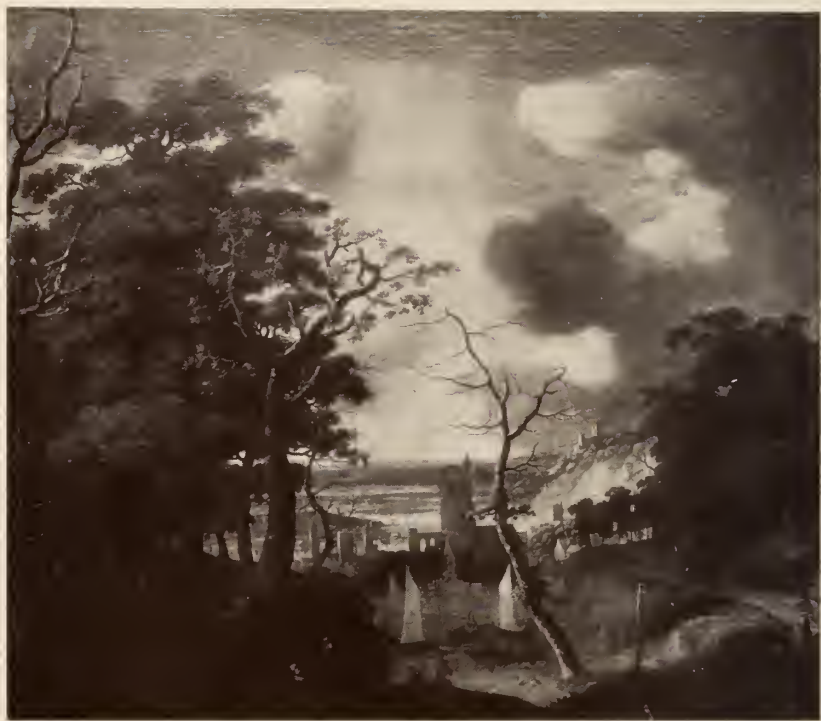
No. 79. BIRD'S-EYE VIEW IN HOLLAND By Philip de Koninck